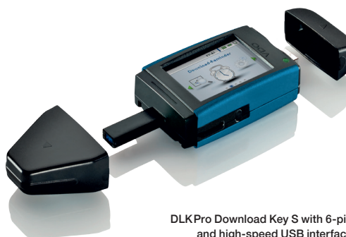
DLKPro Download Key S with 6-pin and high-speed USB interface