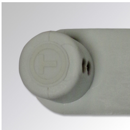
T logo engraved