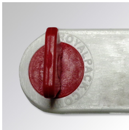
Manufacturer identification engraved