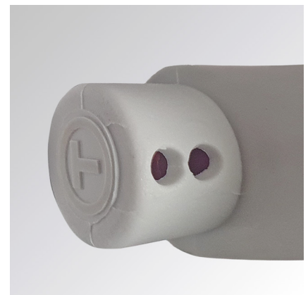
Oversized entry holes